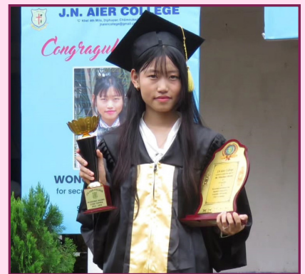
TOP 1 IN SOCIOLOGY HONOURS NAGALAND UNIVERSITY, 2024