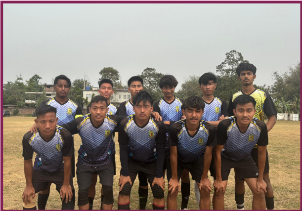
College Football Team