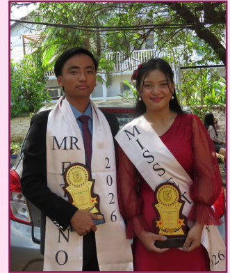
BEST ATTENDANCE 2025-26