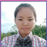
Litanla Class Topper CGPA-6.88 8th Position NU (Political Science)