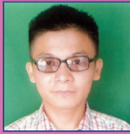
Imkongsunup 61.93%, Top 7 NU (General)