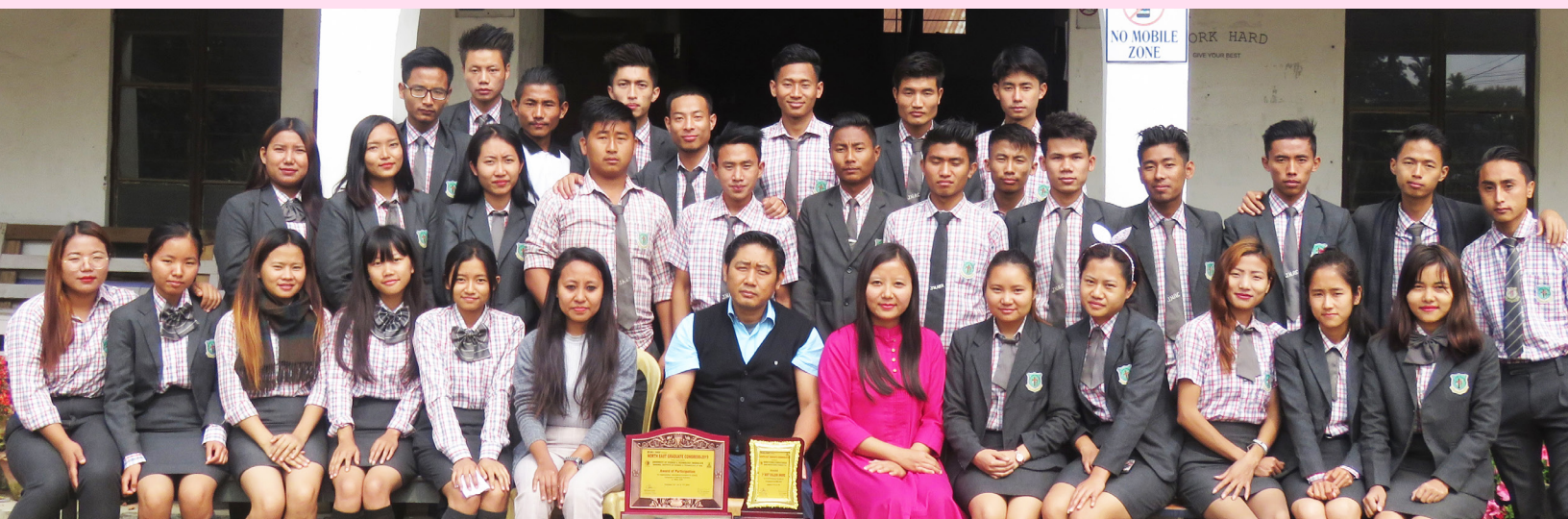
DECLARED 3 RD BEST COLLEGE IN THE NORTHEAST DURING THE 6 TH NORTHEAST GRADUATE CONGRESS 2019