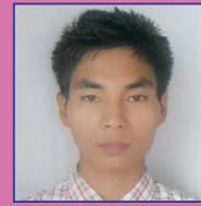
Duzhoho CGPA : 6.27, Top 6 NU (General)