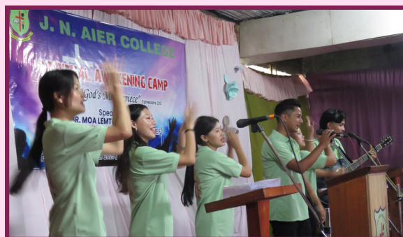
PRAISE & WORSHIP TEAM