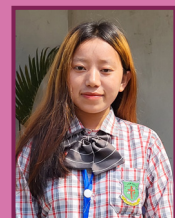
Liopila H CGPA 8.54 out of 10 Top 10th Position NU Sociology Honours