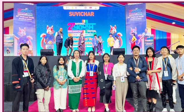
NSS NAGALAND TEAM

❖ All the candidate should produce original documents during Interview and Admission.