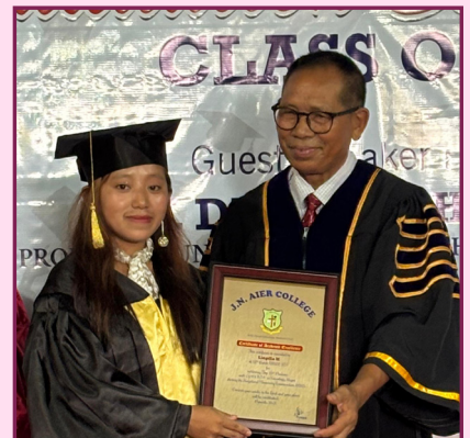
TOP 10 IN SOCIOLOGY HONOURS NAGALAND UNIVERSITY, 2025