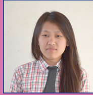
Mewe-ii khutsoh CGPA : 6.13 (English Honours)