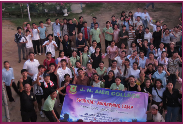
Spiritual Awakening Camp